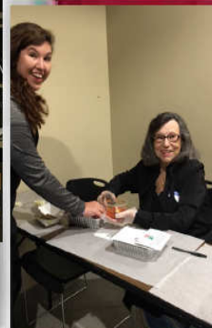
"COOKING with NONNA"